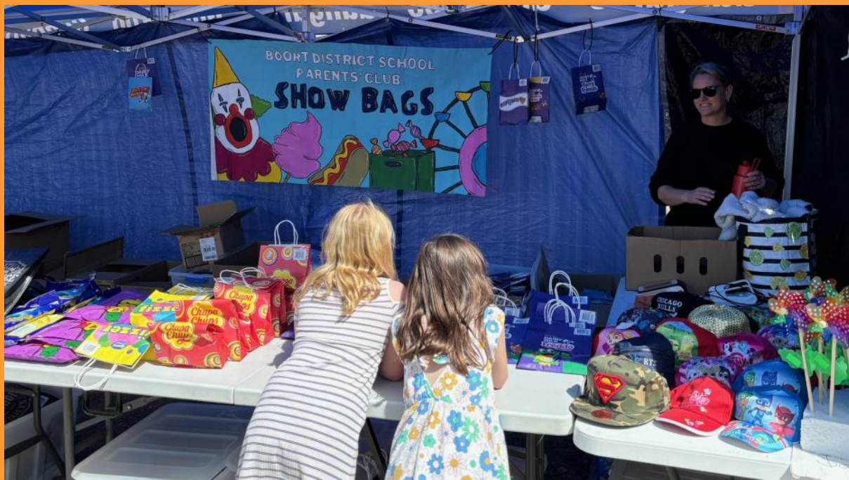
Parents' Club show bags at the Show.